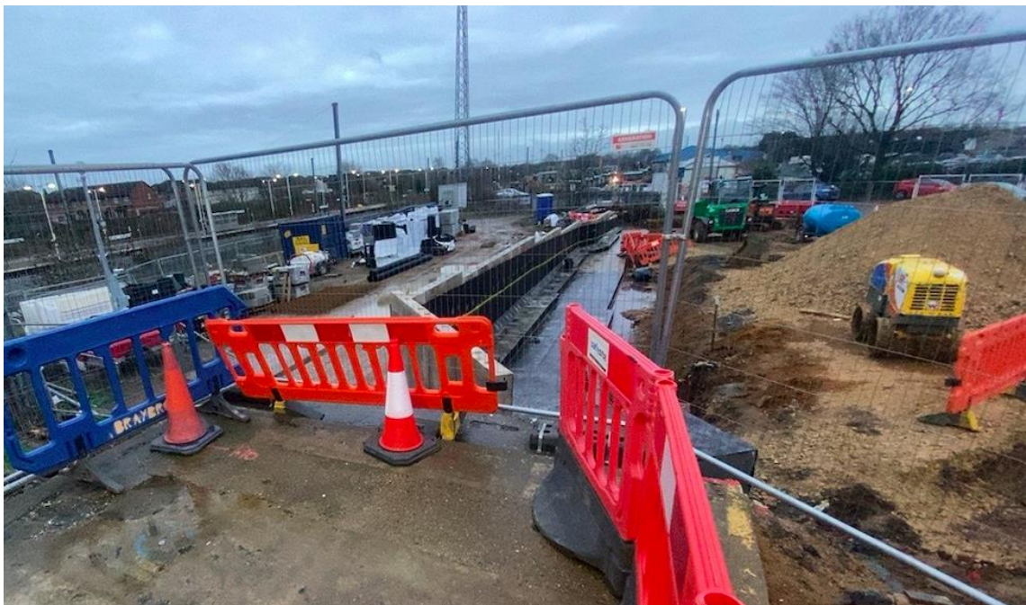
Retaining wall installation