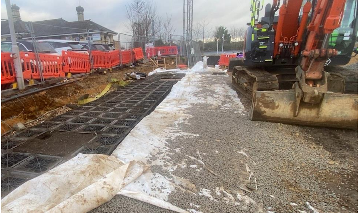
Tree-pit crates installation